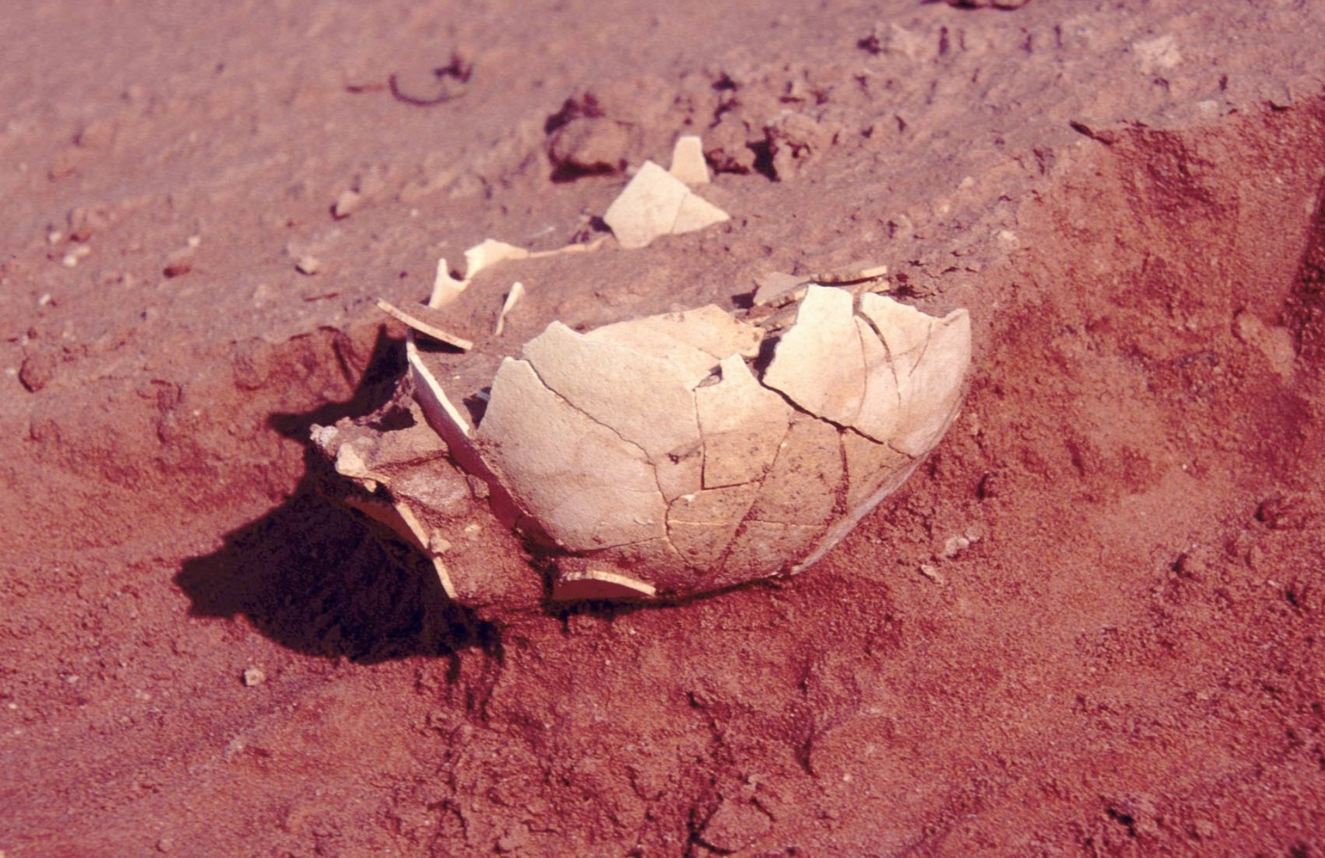
The only known whole egg of Genyornis found in South Australia. Collected by GHM and reconstructed by the South Australia Museum. Known locally as the Spooner Egg. Note predation puncture upper left.