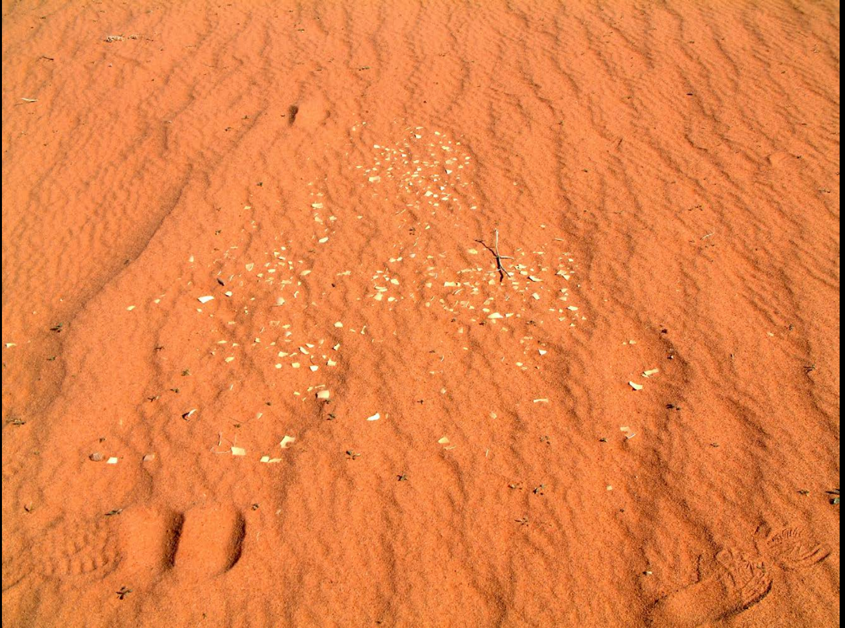
Genyornis eggshells, Nest 1, Geny Heaven, South Australia; the mass of eggshell collected in \sim 1 \text{ m}^2 is equivalent of \sim 12 whole eggs.