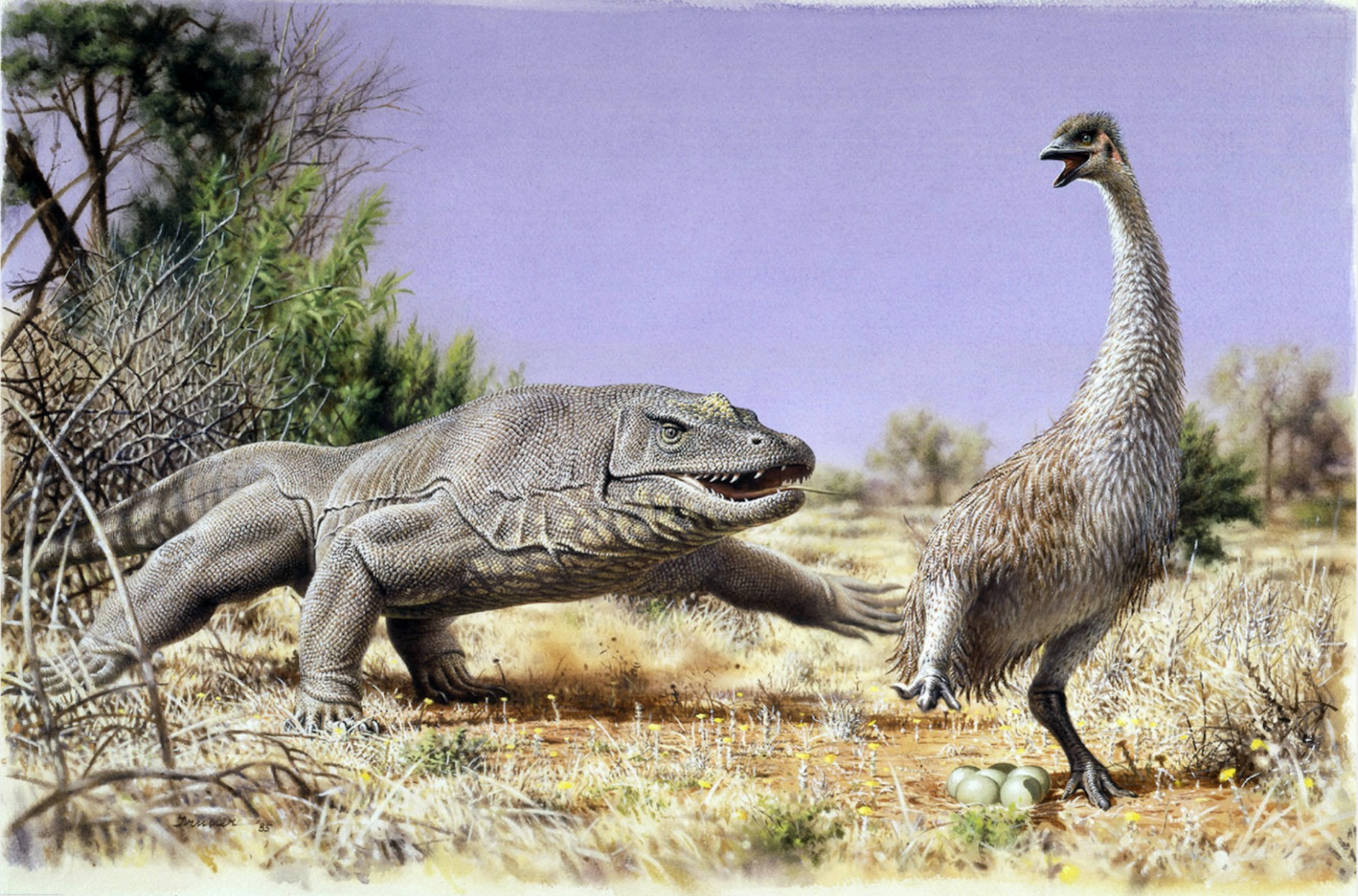
Megalania ( Varanus priscus ) drives Genyornis from the Nest