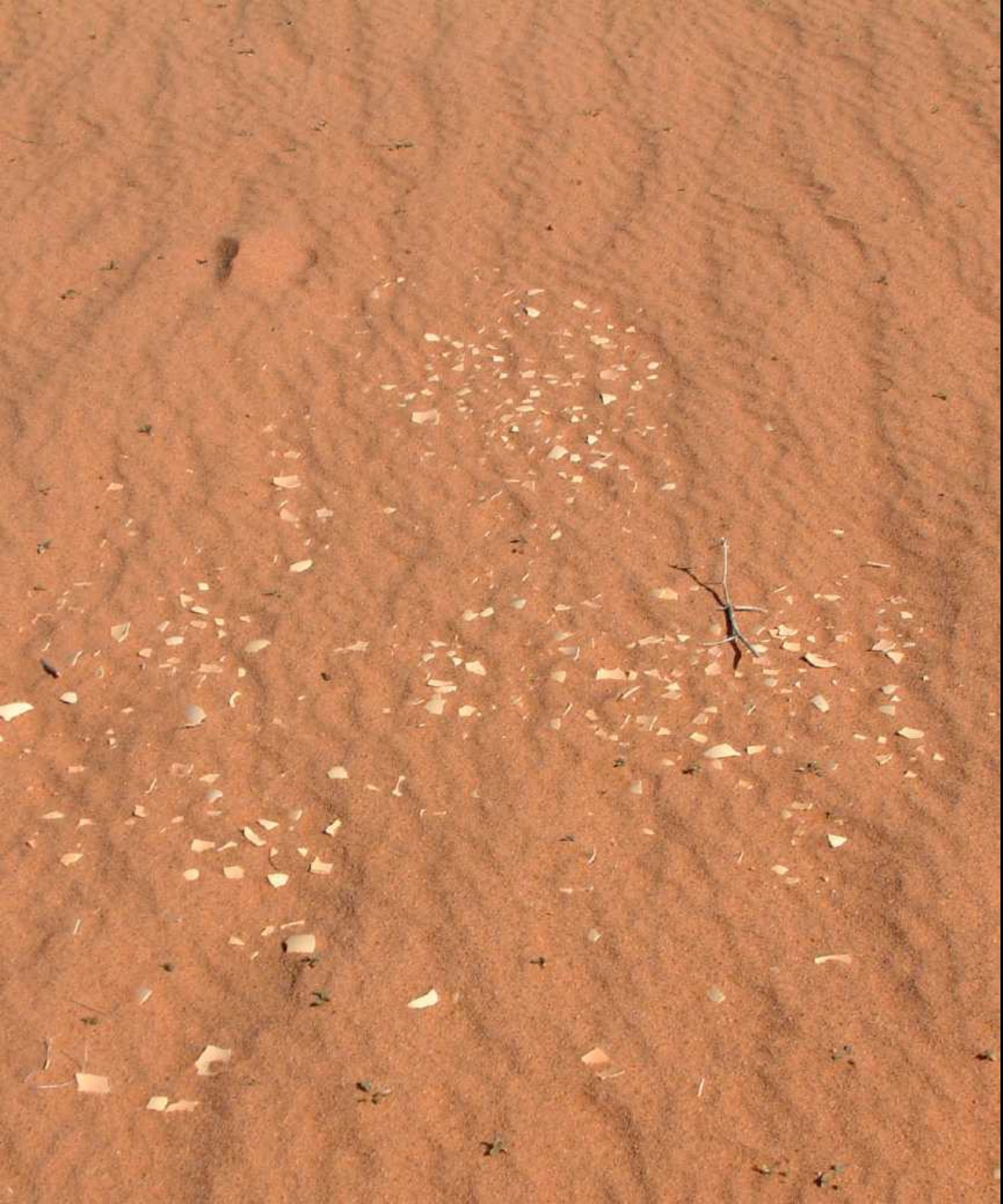
Genyornis eggshells , Nest 1, Geny Heaven, South Australia