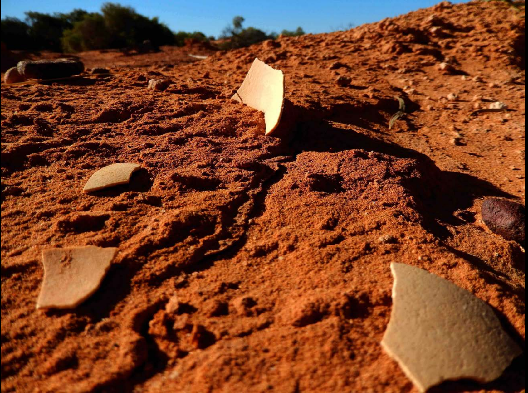
Genyornis eggshell recently exposed by wind erosion of sand dune in which it was buried, South Australia