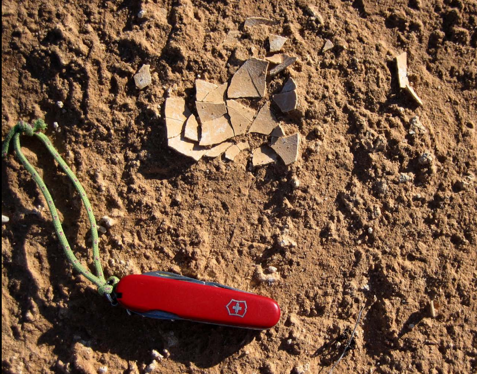
Fragmented Genyornis eggshell found in situ near Etadunna Station, South Australia