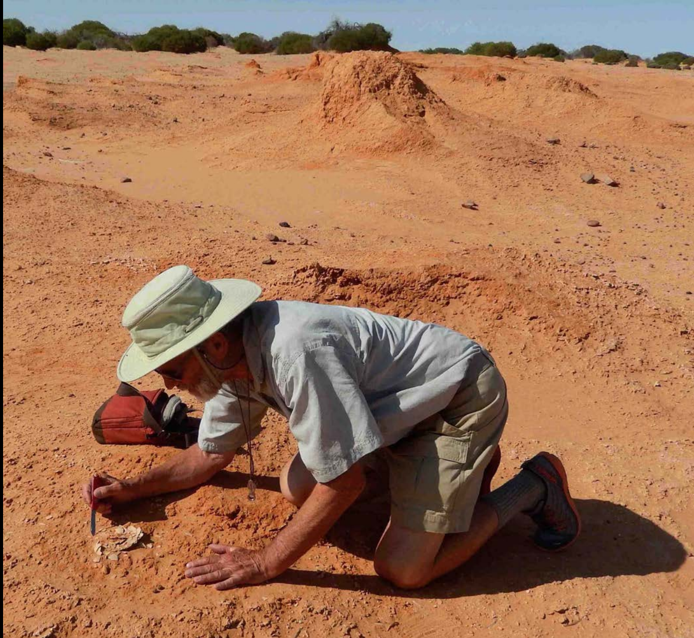
GHM collects single eggshell of Genyornis , Arcoona Station, South Australia