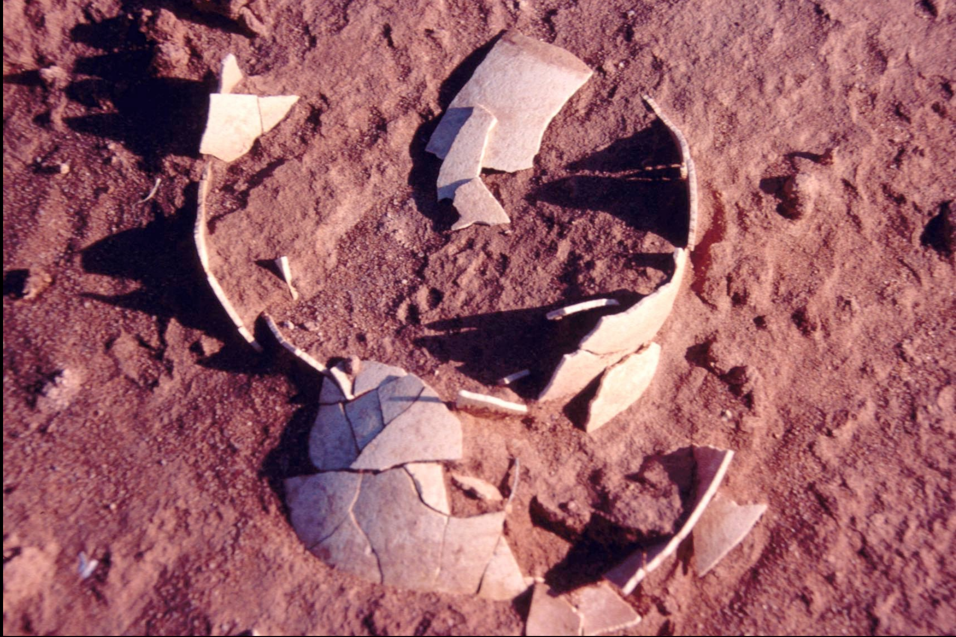
Recently exposed nearly complete eggshell of Genyornis , South Australia