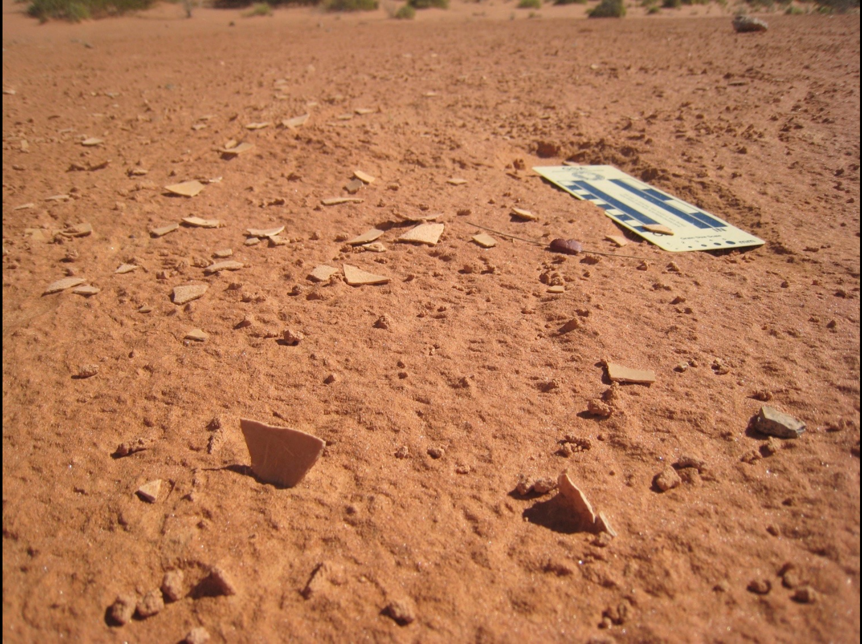
Genyornis eggshell fragments exposed by wind erosion of sand dunes, West Australia