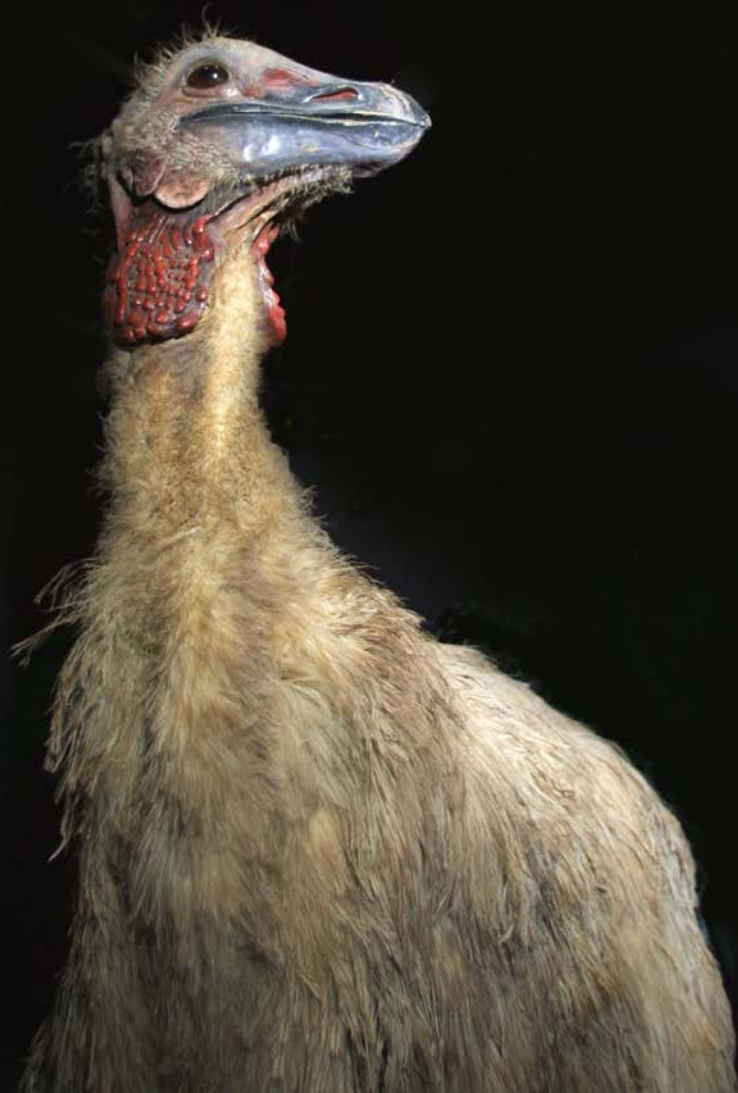
Reconstructed Genyornis , Maybe from the Australian Museum, Sydney.